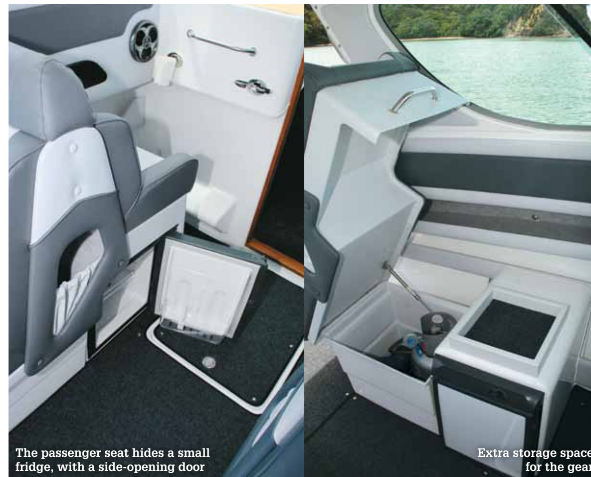
The passenger seat hides a small fridge, with a side-opening door

Pop-up stainless cleats are in each corner of the transom, which has no step-through but two more padded seats on each side. A live-bait tank is fitted into the port-side transom, while teak trim adds a touch of class to the boarding platforms on either side