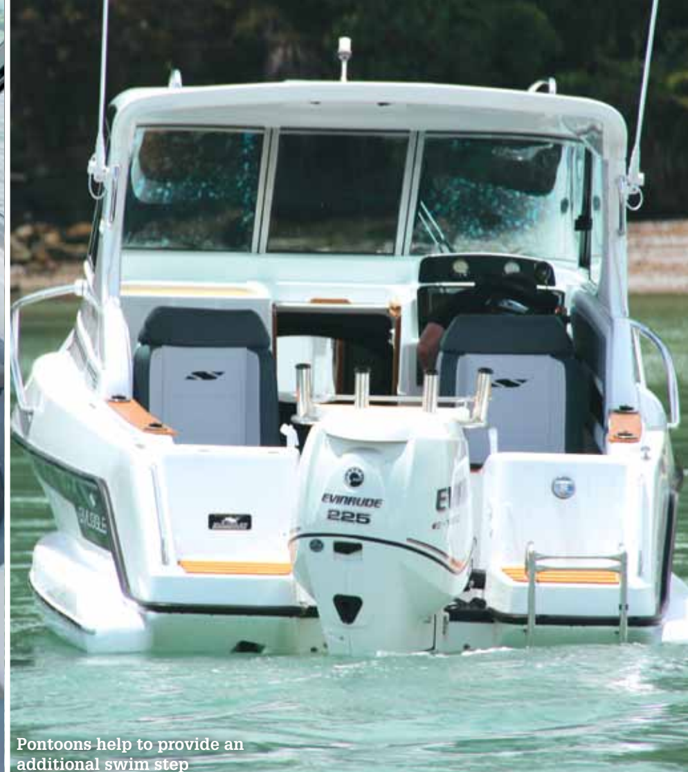
Pontoons help to provide an additional swim step