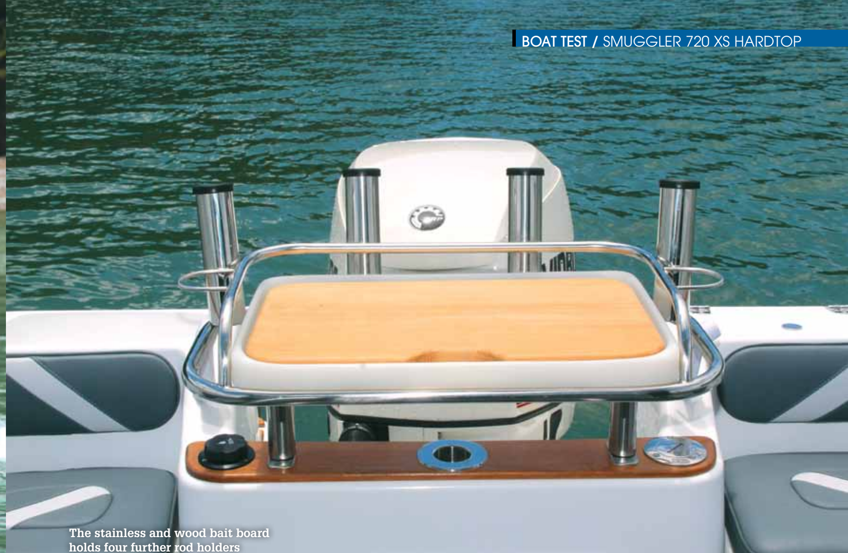
The stainless and wood bait board holds four further rod holders