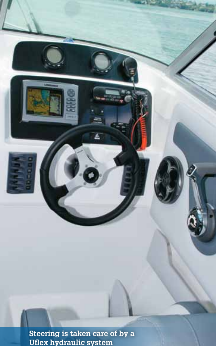
Steering is taken care of by a Uflex hydraulic system