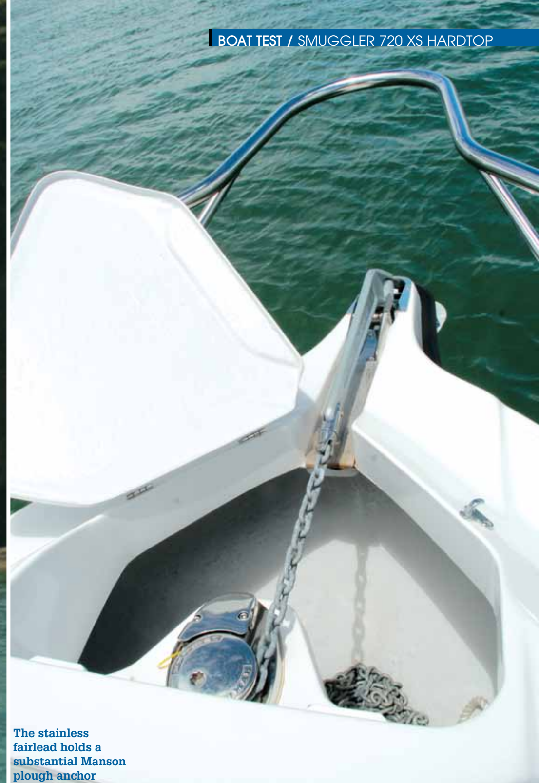
The stainless fairlead holds a substantial Manson plough anchor

Going into the forward cabin, two full-length bunks are found, with an infill to turn them into a generous double. The squabs are luxuriously upholstered in a dark-grey fabric, none of the thin lumpy squabs that some boats have. A hinged section swings up to reveal an electric flushing toilet tucked discretely away. A mirror and two padded parcel shelves complete the interior trim, and of course the entire cabin, including roof, is carpeted. A clear polycarbonate hatch plus two side windows give plenty of light, and a sliding door (which