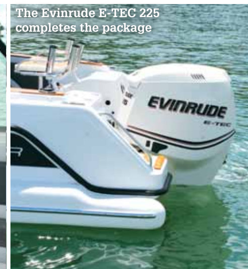
The Evinrude E-TEC 225 completes the package