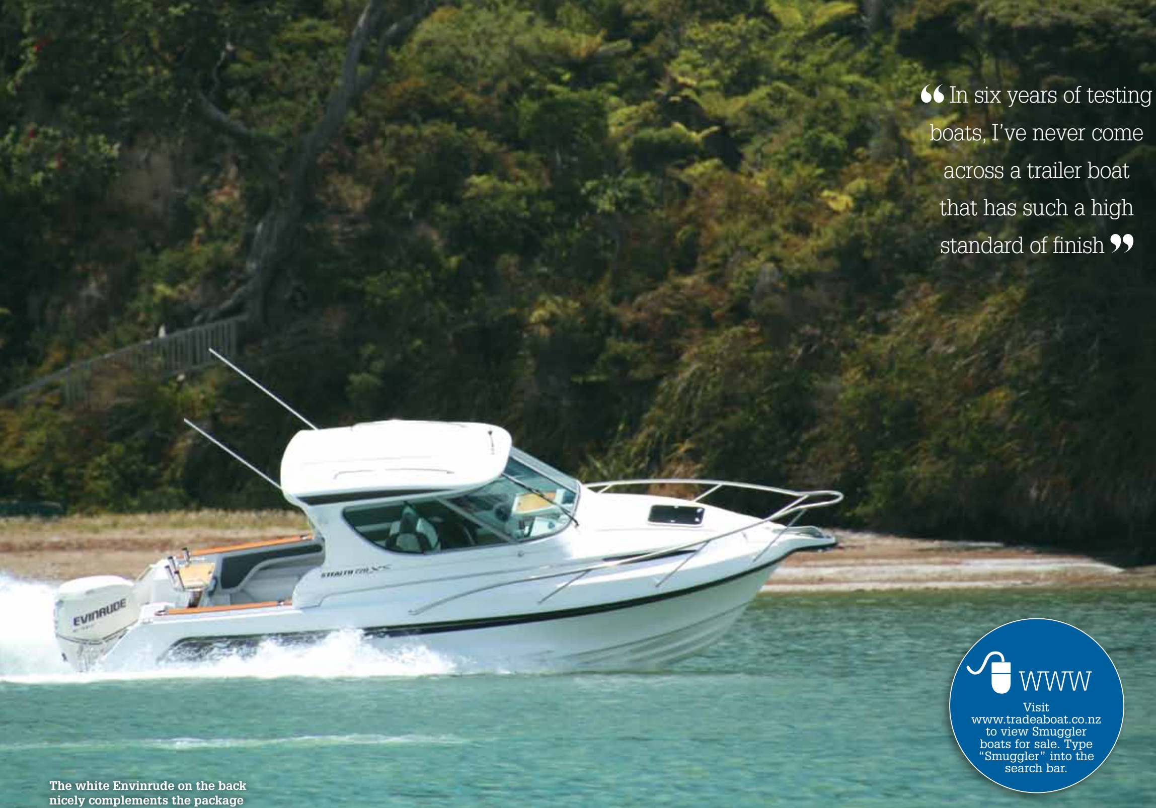
The white Evinrude on the back nicely complements the package

“ In six years of testing boats, I’ve never come across a trailer boat that has such a high standard of finish ”